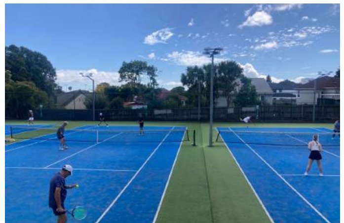
Club Champs in action

Once we have received enough expressions of interest, we will be in contact with the next steps.